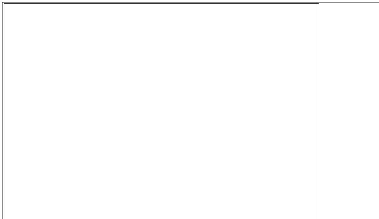
Fig.2. Usefulness of Thematic networks: participation and outputs